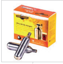
CO 2 CARTRIDGES